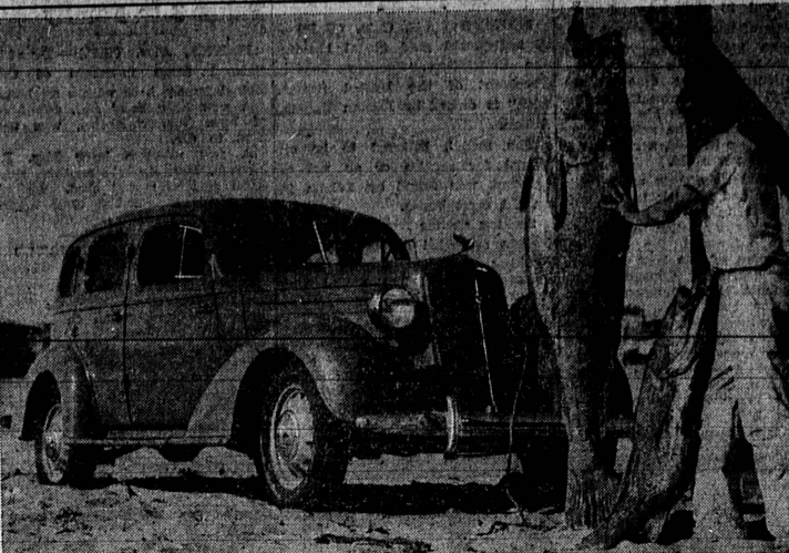
A giant Totuava (sea bass) weighing 176 pounds, was among the many fish landed by a party of Southern California sportsmen who recently made a trip to Santa Clara, a small fishing camp located 100 miles south of Yuma, Arizona, on the gulf of California. They made the jaunt in the Chevrolet Master De Luxe sedan seen here. One of the party is shown above with two of the Totuavas caught at the world-famous fishing grounds.