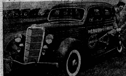
Henry Ford tries out the 2,000,000th Ford V-8 just prior to its leaving the Ford Motor Company's Dearborn, Mich., plant for San Diego, where the car will be exhibited at the Ford Exposition at Balboa Park early in July. Edsel Ford is seen with his foot on the running board.

The two millionth V-8 Ford—the one millionth Ford built in less than 12 months and approximately the 23,000,000th Ford ever built—is headed for America's Exposition, San Diego, where it will be placed on exhibition July 6th.