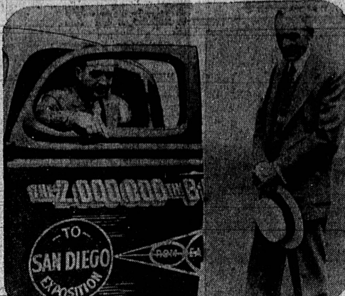
Edsel Ford is shown pointing to Henry Ford, his father, the legend on the 2,000,000th Ford V-8 which rolled off the assembly line at the River Rouge plant, Dearborn, Michigan, on June 13th.