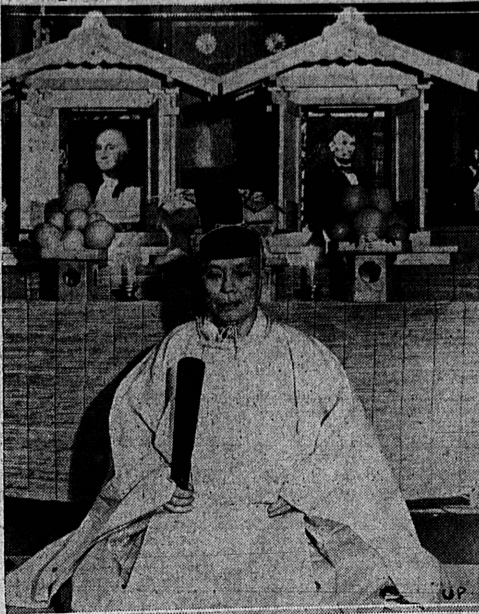
For the first time in American history Occidentals have been honored by ancient Japanese rites. With three Nipponese priests intoning the ritual, pictures of George Washington and Abraham Lincoln were enshrined at a 2500-year-old festival. The pictures were set in Shinto temples at Yamato Hall, in the "Little Tokio" section of Los Angeles.