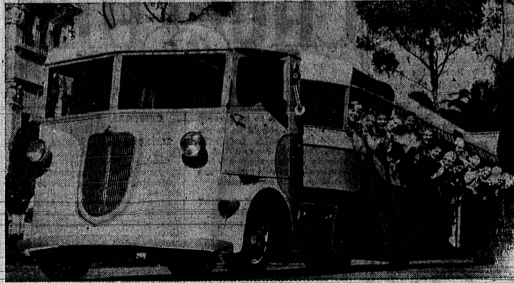
With seats in each for 40 passengers, huge buses mounted on Ford V-8 truck chassis will, under the direction of the San Diego Railway Co., ply the grounds of the California Pacific International Exposition, opening May 23 in San Diego. Above is a photograph of one of the buses after its delivery to the Exposition, peopled by the Expositionettes, a girls' organization in San Diego, on its way to the Ford Exposition site.