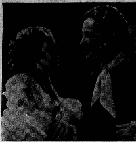
Loretta Young and Ronald Colman in "Clive of India," a 20th Century Picture, released through United Artists.

The black crime of the Black Hole of Calcutta is brought to light on the screen for the first time in "Clive of India," Darryl F. Zanuck's million-dollar 20th Century production starring Ronald Colman, which comes to the Torrance Theatre tonight, Friday and Saturday.