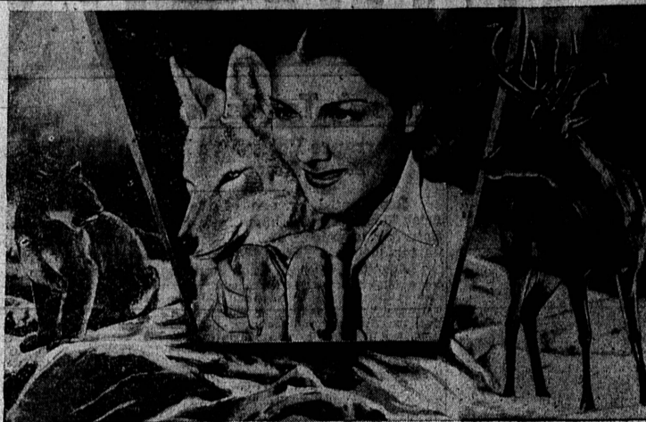
Jean Parker in a Scene from "Sequoia"