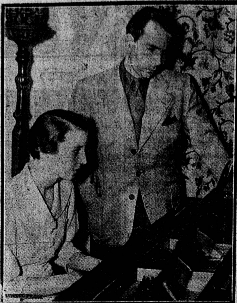
Rivalling any motion picture script is the real life of Mr. and Mrs. Sigvard Bernadotte. Bernadotte is the grandson of the king of Sweden and renounced his right of succession to the throne to marry his commoner bride. The couple live in a little five-room bungalow in Beverly Hills.

FREE THEATRE TICKETS! Turn to the classified page.