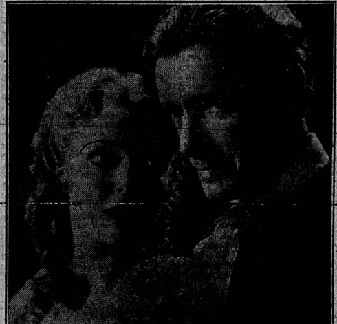
Ronald Coleman and Loretta Young in "Clive of India"