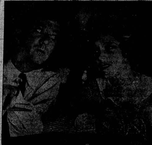
Lee Tracy and Sally Eilers appearing in "Carnival."