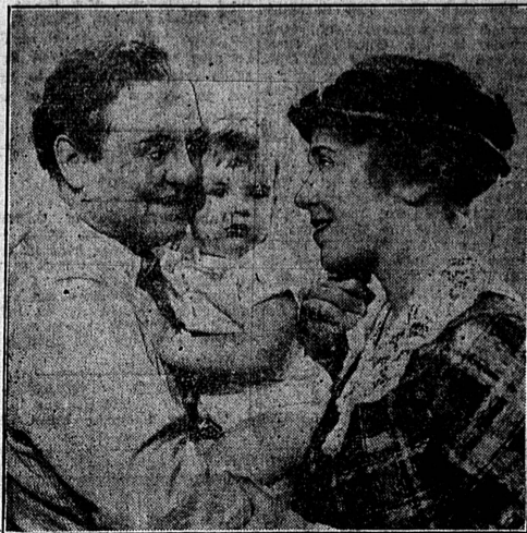
Leo Carrillo and Louise Fazenda appearing in "The Winning Ticket."