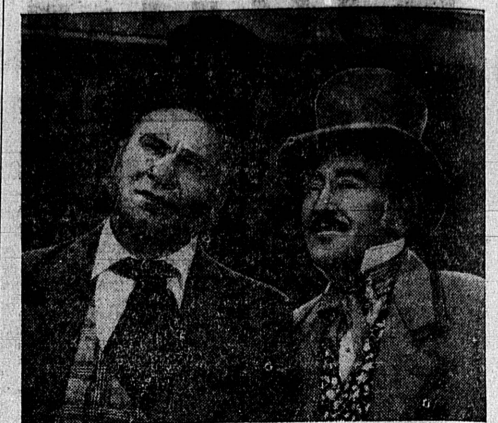
Wallace Beery as the shrewd Phineas T. Barnum, self-styled "Prince of Humbugs," and Adolphe Menjou as Mr. Walsh, his stippling aide in 20th Century's "The Mighty Barnum," which comes Sunday, Monday and Tuesday to the Lomita Theatre. On the same bill at the Lomita Theatre, starting Sunday, will be seen Constance Bennett and Herbert Marshall in "Outcast Lady."