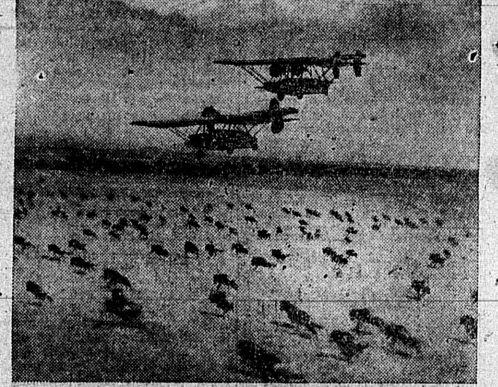
A herd of African buffalo in full flight before the planes of Mr. and Mrs. Martin Johnson, intrepid African adventurers whose latest film, "Baboona," is released by Fox. 60,000 miles were covered by the Johnsons in making this aerial epic—and it was two years in the filming.

When Mr. and Mrs. Martin Johnson returned from Africa recently with their latest jungle film, "Baboona," coming Sunday and Monday to the Torrance Theatre, they knew that they had some 170,000 feet of scenic and animal "shots." But they didn't know what highlights would supply the theme of their picture.