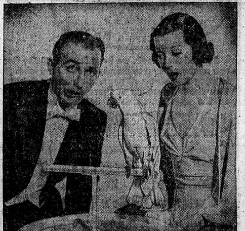
For the first time in Bing Crosby's meteoric film career, Paramount's popular crooner-comedian appears with the same leading lady in two pictures, thus beginning the career of another of Hollywood's famous romantic teams.

Crosby, in his new Paramount picture, "Here Is My Heart," coming Sunday to the Plaza Theatre, Hawthorne, is again featured with Kitty Carlisle, who first appeared opposite him in the leading roles of "She Loves Me Not."