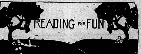
READING FOR FUN