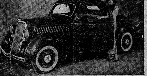
BEAUTY, a characteristic of all the 1935 Ford models, is exemplified here in the 3-window De Luxe Coupe.