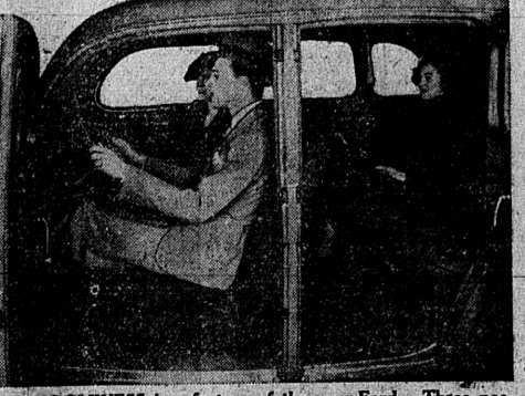
ROOMINESS is a feature of the new Ford. Three passengers can ride in front or back seats with equal comfort.