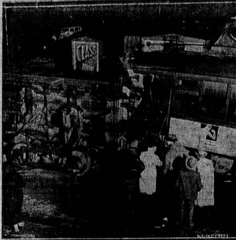
Thirteen people were injured, one perhaps fatally, when these two streetcars crashed in strike-town Los Angeles. Investigators reported that the cars met head-on, one being turned over by the crash. It was disclosed that the wreck had been caused by a plugged switch.