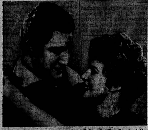
Robert Donat and Elissa Landi in Reliance's "The Count of Monte Cristo," released through United Artists and showing tonight, Friday and Saturday at the Torrance Theatre, Sunday, Monday and Tuesday, December 9, 10 and 11. Joe E. Brown is also on the same bill these three days in his latest laugh-comedy, "Six Day Bike Rider."