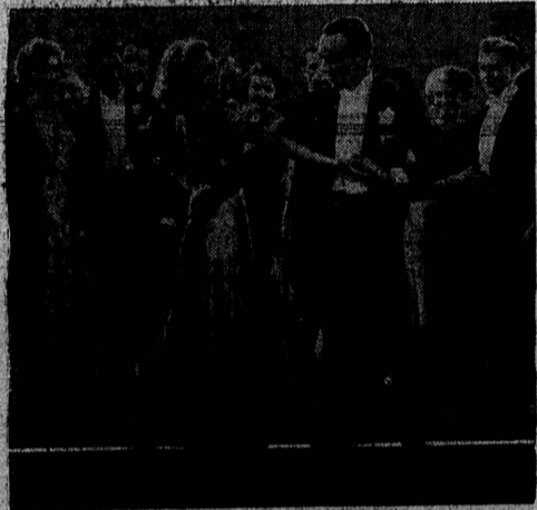
Those dancers de luxe, Fred Astaire and Ginger Rogers, are seen above, doing the "Continental," sensational dance in "The Gay Divorcee," which comes to the Plaza Theatre, Hawthorne, Sunday, Monday, and Tuesday, December 9, 10 and 11. The popularity of "The Continental" in its ballroom form, bids fair to surpass the "Cariboo," which these same two stars made an international hit.