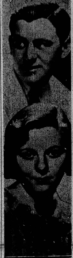
William Wyler, motion picture director, and Margaret Sullivan, film star, surprised Hollywood by eloping to Yuma, Arizona, where they were married.