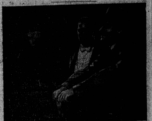
Ronald (Bulldog Drummond) Colman, seems eager to be handcuffed by Officer Halliwell Hobbes in this scene from "Bulldog Drummond Strikes Back," 20th Century's new comedy mystery thriller which United Artists brings to the Lomita Theatre, Friday and Saturday, November 18 and 17. No doubt leaving Warner Oland has something to do with his anxiety to get away. Jean Blondell and Glenda Farrell are featured in "Kansas City Princess," the companion picture at the Lomita Friday and Saturday.