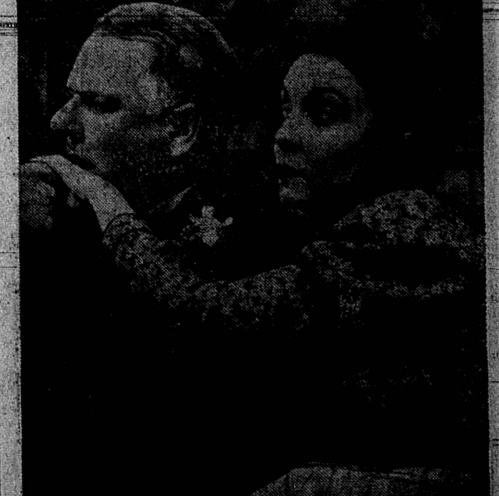
"Don't bite the hand that fed you!" Zasu Pitts is cautioning W. C. Fields in a scene from Paramount's "Mrs. Wiggs of the Cabbage Patch," coming tonight, Friday and Saturday to the Torrance Theatre. But despite her apprehensions, Fields, with his courtly "furrin' ways, is merely impressing a kiss on the lily white fingers that have so recently served him his victuals.