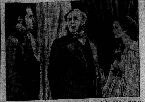
Three Academy of Motion Picture Arts and Sciences Award winners head the cast of "The Barretts of Wimpole Street," to be shown Sunday, Monday and Tuesday, November 18, 19 and 20, at the Torrance Theatre. Norma Shearer, in the role of the poet Elizabeth, is