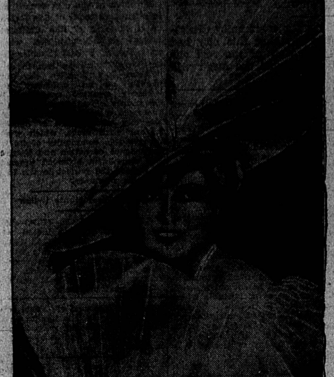
In her third Paramount starring picture, "Belle of the Nineties," coming to the Plaza Theatre, Hawthorne, Tuesday, Wednesday and Thursday, November 20, 21 and 22, Mae West plays as a St. Louis burlesque queen who becomes the darling of the gay New Orleans of the nineties. Roger Pryor, Johnny Mack Brown and John Miljan are also featured. On the same bill at the Plaza appears Nils Asther in "Love Time."