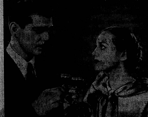
Jean Muir and George Brent are seen above in a toast to love and romance, one of the gripping scenes in "Chained," their latest Paramount triumph which shows at the Lomita Theatre, Sunday, Monday and Tuesday, November 18, 19 and 20. The story is of a girl who, in love with one man, feels that she owes allegiance to another. Her "chains" are finally broken and she finds happiness. Jean Muir and George Brent in "Desirable" also appear on the same bill at the Lomita Theatre.