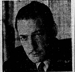
Warren William in "The Mystery of the Howling Dog"