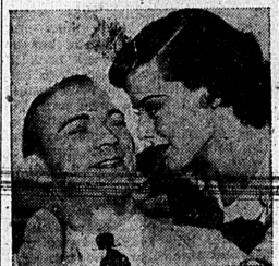
Lee Tracy as the "Lemon Drop Kid"