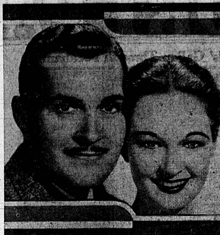
A Scene From "Mrs. Wiggs of the Cabbage Patch"