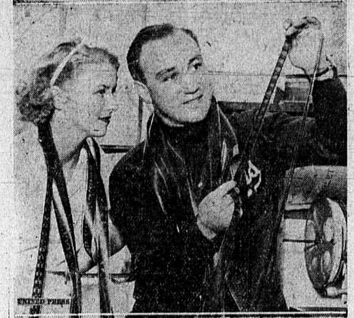
Jackie Fields, former welterweight boxing champion, gathered a small fortune in the ring, but lost it in business misadventures. Now he is cutting film for a Hollywood movie studio. The former champion is showing some of his finished work to Betty Furness, pretty Metro-Goldwyn-Mayer featured player.