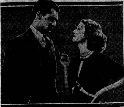
Loretta Young and Cary Grant in "Born to Be Bad"