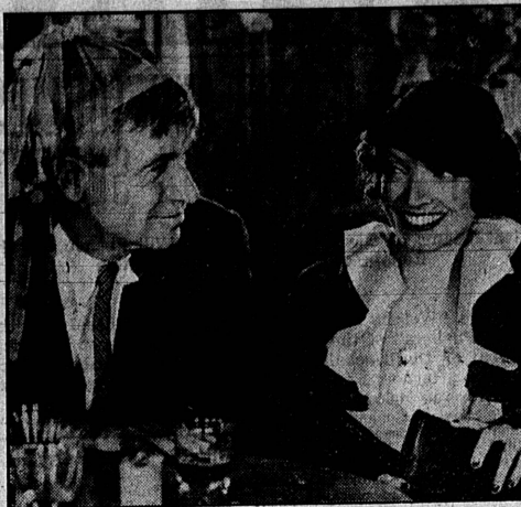
HIS WIFE WANTS HIM TO PLAY, AND HE DOES!—Will Rogers as he appears in "Handy Andy" with Conchita Montenegro

The chances are that Will Rogers saw right through the gag from the very beginning. But this is the way it works: