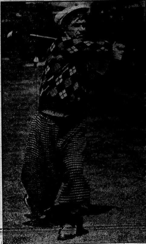
HE PLAYS AS HARD AS HE WORKS—Will Rogers learning golf with uproarious results in "Handy Andy" 2PB