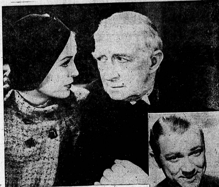
PREDICAMENT DIRE! With the government aroused, Princess Helen and Archduke Ferdinand, mere dupes in the hands of Count Strunsky, faced imprisonment and perhaps death. It was at this point that Brown (right) stepped in and began arguing with the president of the republic. He found himself with the most serious problem of his life on his hands. How could he secure their freedom? But he was his own smiling self, just the same.

"How'd you like the queen racket—as long as it lasted?" he asked her.