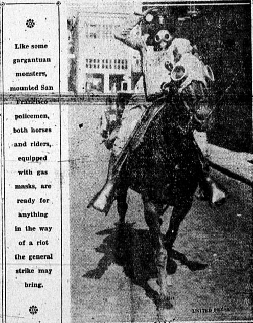
Like some gargantuan monsters, mounted San Francisco policemen, both horses and riders, equipped with gas masks, are ready for anything in the way of a riot the general strike may bring.