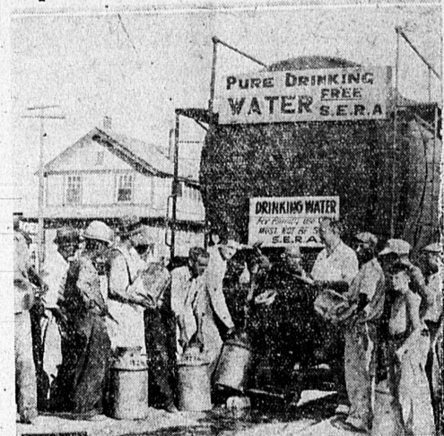
Imperial Valley, Cal., ranchers are faced with a serious water shortage. Millions of gallons will have to be shipped into the fertile valley to relieve one of the worst droughts the valley has seen. In this picture domestic water is being distributed to rural residents of the valley. The water was shipped into the valley at the urgent appeals of county and irrigation district governmental boards.