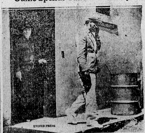
Jack Oakie, screen comedian, spent five hours in the San Bernardino, Cal., jail, and then spent $100 to get out. The forced confinement and expenditure came as a result of his arrest on alleged reckless driving charges. The film comedian is pictured as he left the jail to appear in police court.