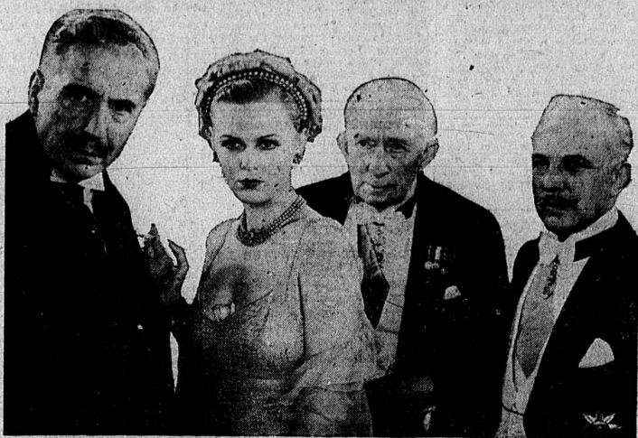
AMAZED BY REPORTS! Count Strunsky, Princess Helen, Archduke Ferdinand and Prince Julio were amazed to learn that spies were at work in the Hotel Europa at Vichy, and that efforts were being made to find out if Count Strunsky was in the hotel. Strunsky realized that immediate flight was imperative if his plans were to be kept secret.

discussing at the old duke's birthday party. That's why I'm here. They're in the next room."