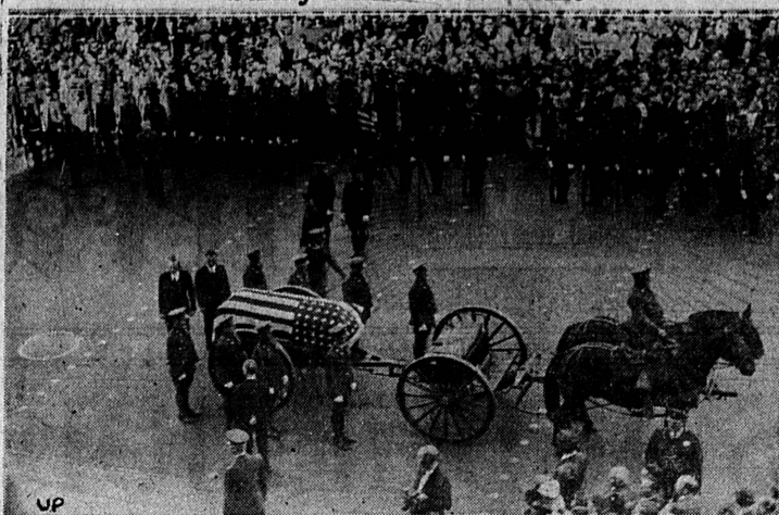
Under the great dome of the San Francisco City Hall, of which he used to boast so proudly, California's governor, "Sunny Jim" Rolph, lies in state. The casket bearing the remains of the governor is shown as it arrived at the City Hall, where thousands gathered to see "Jimmy" come home.