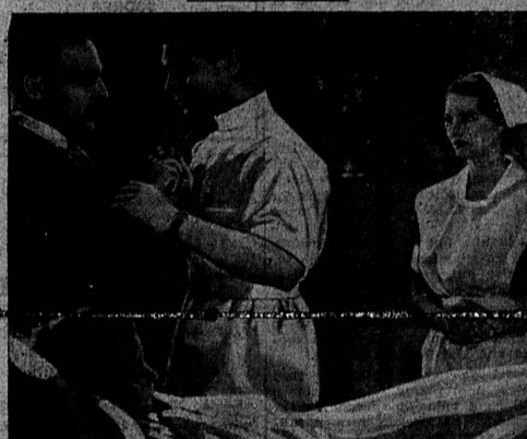
C. Henry Gordon, Clark Gable, Elizabeth Allan in "Men in White"