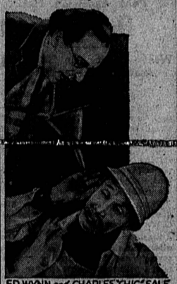
ED WYNN and CHARLES "CHIC" SALE in "THE CHIEF"