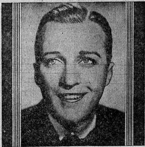
Bing Crosby in "We're Not Dressing"