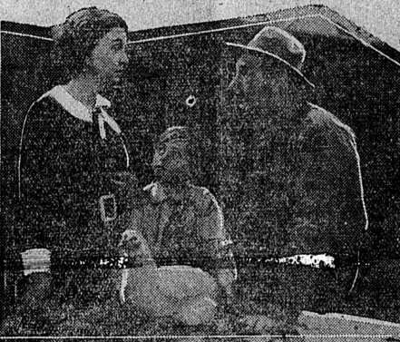
Scene From "LOVE BIRDS" - UNIVERSAL PRODUCTION