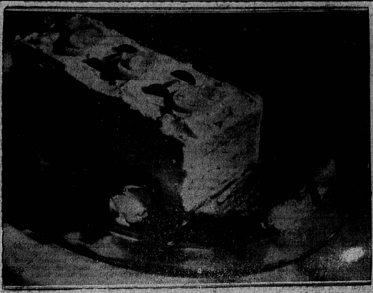
The sandwich loaf, as delicious as it is attractive, and an answer to the hostess who is puzzled by what to serve at bridge parties and luncheons.