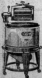
Apex Model 57