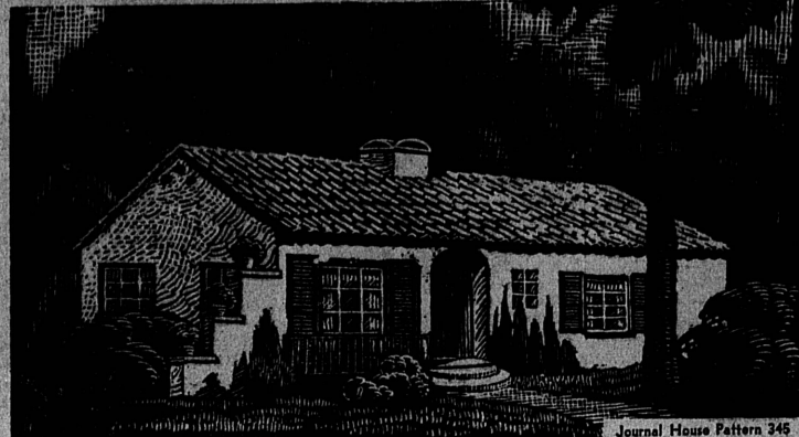
Journal House Pattern 345

In the front room an extra outlet or two can change the whole aspect of that room at night; better lights offer lighting efficiency and this is sadly neglected in a great majority of homes.