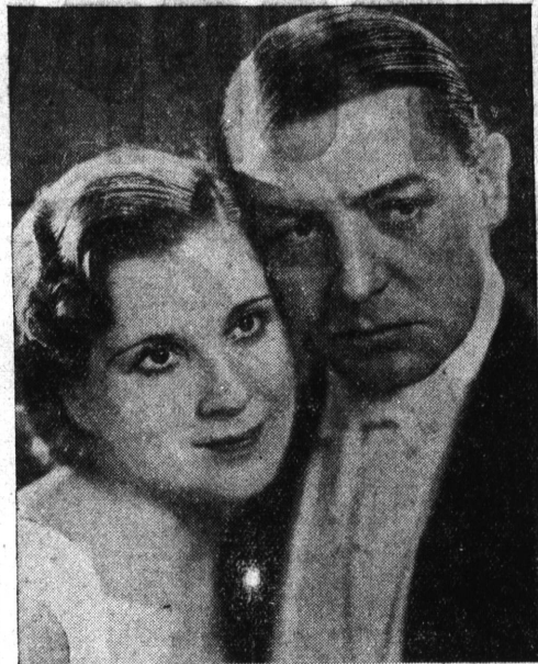
Diana Wynyard and Clive Brook portray the two characters in the Fox production of Noel Coward's "Cavalcade," around whom the march of world events patterns its drama.