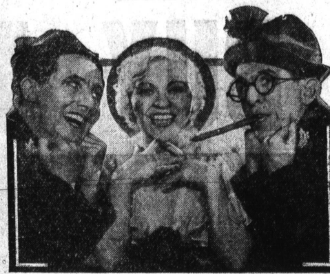
Bert Wheeler and Robert Woolsey run the gamut of high-powered musical comedy nonsense in "Diplomaniacs," with your old favorite, Marjorie White.