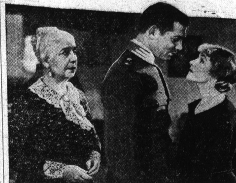
LOUISE CLOSSER HALE, CLARK GABLE and HELEN HAYES in "THE WHITE SISTERS"