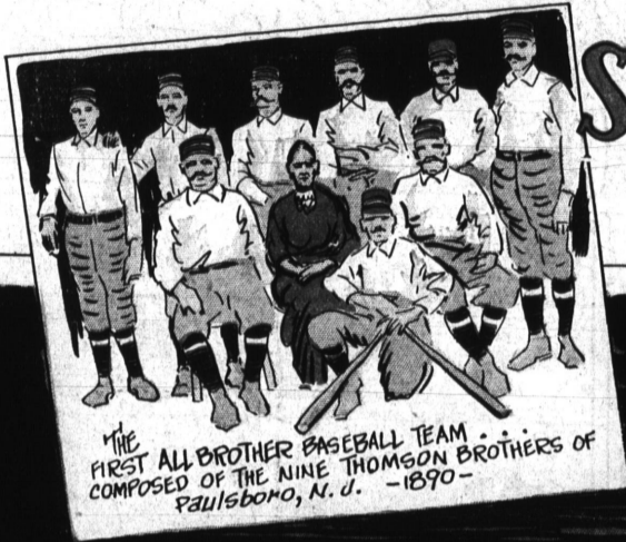
THE FIRST ALL BROTHER BASEBALL TEAM COMPOSED OF THE NINE THOMSON BROTHERS OF PAULSBORO, N. J. - 1890 -