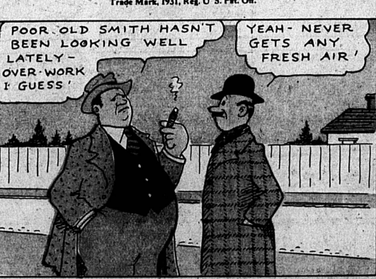
By Ernie Bushmiller