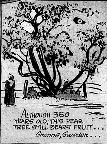
ALTHOUGH 350 YEARS OLD, THIS PEAR TREE STILL BEARS FRUIT... Grenna, Sweden...