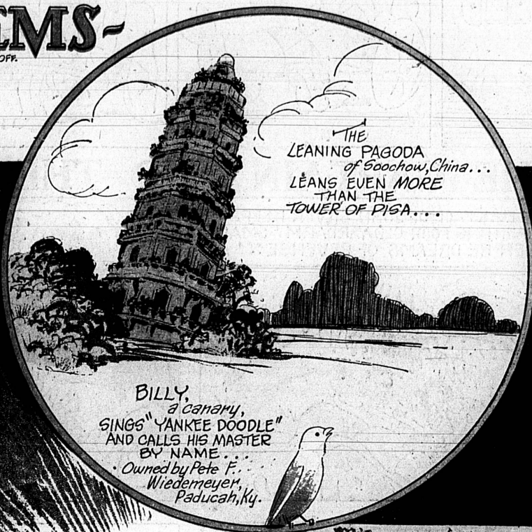
THE LEANING PAGODA of Soochow, China... LEANS EVEN MORE THAN THE TOWER OF PISA...