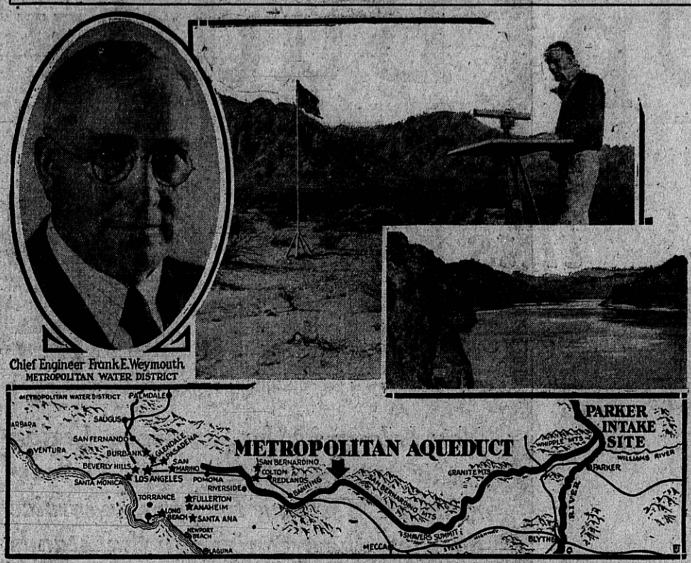
Aqueduct route up to point where feeder lines to cities in District may connect with main system. (Above) One of the field enginerark on Aqueduct route. (Inset, right) View of Colorado River at Parker intake site. Stars on map indicate cities in District.