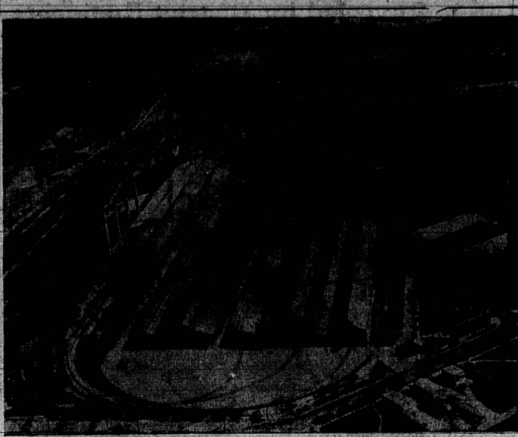
COLUMBIA STEEL'S GREAT PLANT AT TORRANCE