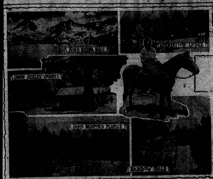
Camp Seelye, Camp Radford, and Camp High Sierra, the mountain playgrounds operated by the L. A. Department of Recreation, will provide wholesome recreational vacations for thousands of families from June to September, at low rates made possible by municipal management.

Where to go for that 1930 vacation, a question of increasing importance to thousands of families as summer days draw nearer, will be answered for many people today by the announcement of the Los Angeles Playground and Recreation Department that reservations are now being taken for outings at three municipal mountain camps, Seelye, Radford, and High Sierra. For those who prefer the mountains as the scene of their vacation, these public playgrounds will again offer the happy recreational outings at low cost which thousands enjoyed last year. Because of municipal management, the three camps are able to provide young and old with all inclusive vacations on a non-profit basis which brings such excursions within the reach of people in all walks of life. Camp Seelye, in the San Bernardino mountains, will begin its summer season on June 8. Because of its complete arrangements, comfortable facilities, and the varied outdoor activities of this playground, its appeal has become widespread as a family vacation spot. Rustic cabins, swimming pool, and the community recreation lodge where dancing, entertainment, and story-tours around the beautiful fireplace result in friendly social evenings help to make outings at Seelye of interest to persons of all ages. While the camp