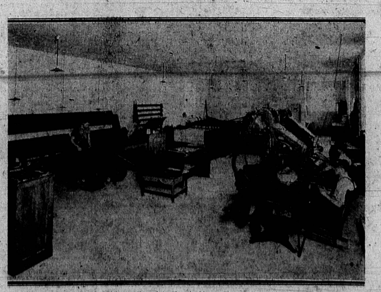
Modern Typesetting Machines Furnish Fresh New Type For News and Advertising Every issue