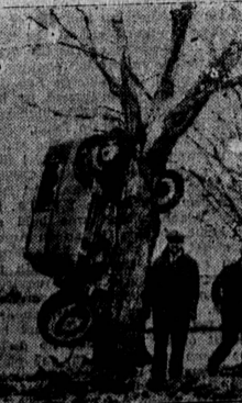
AN AUTOMOBILE CLIMBS A TREE

The city attorney has been called into the problem, with a view of drafting an ordinance which would silence "Old Darcy" for once and for all.