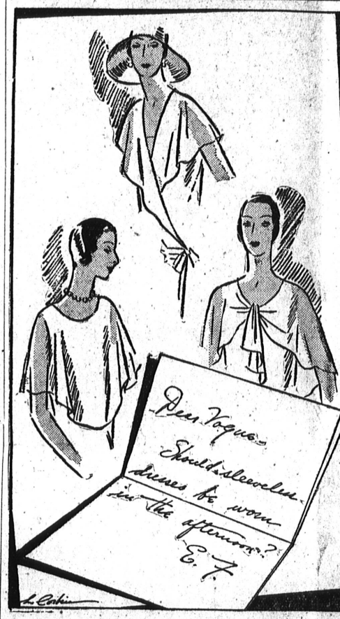
CAPE COLLARS ARE NEW AND SMART ON SLEEVELESS AFTERNOON DRESSES

Dear E. F.: Sleeveless foresees for afternoon wear present several problems to the fagtidious woman. She of the less-than-petriclan will do well to avoid them, and so will she of the less-than-patriclan mien, for nothing is so dislitusioning as the sleeveless line in the light of day. But disregarding these, there remain hundreds of women who qualify for this new fashion and will do well to adopt it.