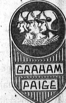
Graham-Paige offers a variety of body types, including roadsters, cabriolets, coupes and sport phaetons, on five classes—at a wide range of prices.

Today... we begin with GRAHAM-PAIGE We take pride in announcing our appointment as Graham-Paige dealers in this community. Graham-Paige sizes and eights, with the new refinements and improvements, and the time-proved four-speed transmission (two high speeds—standard gear shift), are now on display at our showroom—and we shall strive to offer you service facilities which measure up to the Graham-Paige standard. We believe you will appreciate the beauty, modern design, sound construction, fine performance, and substantial value of these motor cars. You are cordially invited to see them, and to enjoy a demonstration.