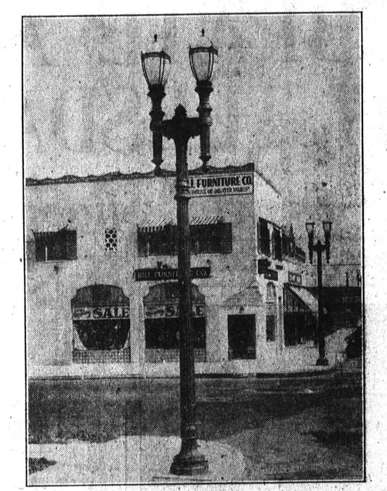
View at Post and Cravens avenues, showing Business District type of lighting standards.

Celebrating the Formal Dedication of City-Wide Ornamental Lighting in Torrance