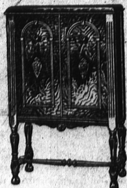
The New SPARTON Console Model 910 with DYNAMIC speaker

Worthy of its distinguished name... a genuine Sparton EQUASONNE, with the "Richest of Radio Voices" that has captivated the entire world. The purity and richness of its magnificent tone will be a thrill you will never forget. You will be delighted with this beautiful console cabinet and its incomparable reception. Visit us... if only to listen.