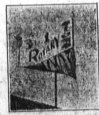
"Three in One Rotary Signs"