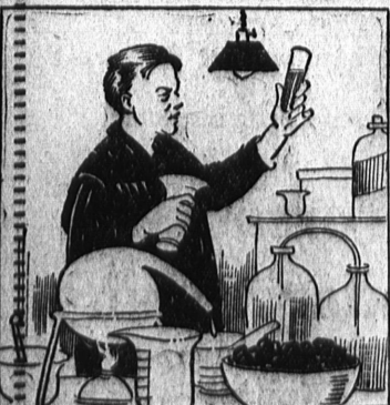
3. His leisure time was spent in scientific experiments in his own private laboratory.