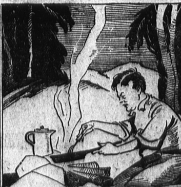
4. Camp life was his vacation hobby. He is the only man who can push an egg on the end of a stick.