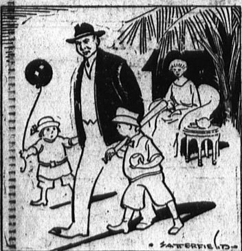
1. After their romantic years in China, the Hoovers settled down in America with their two boys.