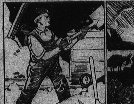
1. After college, Hoover studied the practical side of mining with pick and shovel in Nevada.