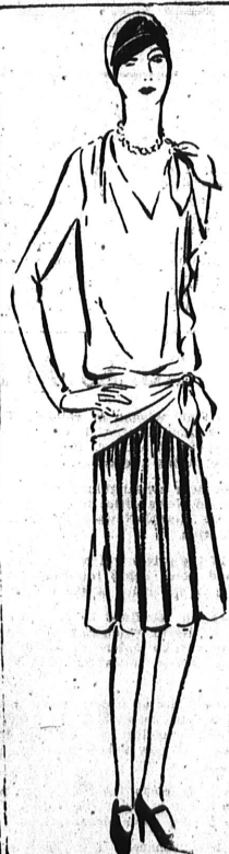
THIS IS A VELVET SEASON

would make anybody look slenderer, and I liked the way the collar stood up and away from the neck. The last coat had one of those new long shawl collars that are so good. A belt was suggested with four rows of tailored stitching, and the way those rows went down at the side would reduce one's apparent girth quite marvellously. Yours as ever, Claribel.