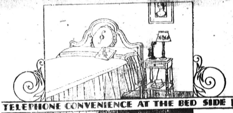
TELEPHONE CONVENIENCE AT THE BED SIDE

WHEN your telephone bell rings after you have retired for the night, it's mighty convenient to reach out from your bed and answer the call.