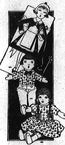
No. 599 KITCHEN 50c Complete No. 604 "ROYAL JACK" STUFFED DOLL 75c Complete No. 603 "SOCIETY JILL" STUFFED DOLL 75c Complete