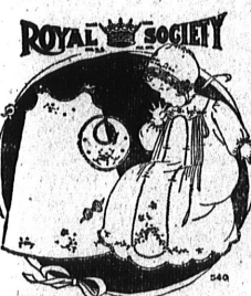
No. 540 WHITE LAWN Price $1.25 EMBROIDERY PACKAGE OUTFIT With Royal Society Guaranteed "Boil-Fast" Embroidery Cottons