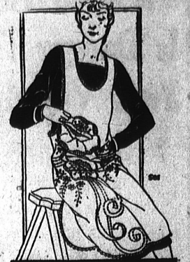
No. 561 ATTRACTIVE APRON Beautifully Hand-Toned on Unbleached. Price 75c Complete