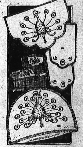
Tan Linen Pillow and Chair Back Set No. 580 PILLOW. $1.35 Complete No. 581 CHAIR BACK. 75c Complete

EMBROIDERY PACKAGE OUTFITS With Royal Society Guaranteed "Boil-Fast" Embroidery Cottons