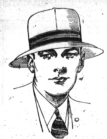
Genuine Panamas Leghorns $4.95 to $6.50