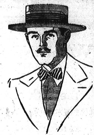
Straws $1.95 and $2.50