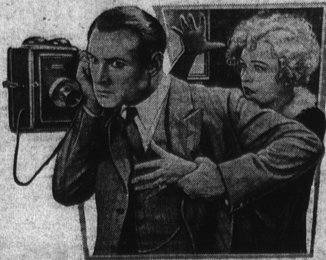
VICTOR VARCONI AND PHYLLIS HAVER, IN "CHICAGO," AT THE

A screen heroine "bad woman" has arrived. The weaker sex, having successfully invaded the arts and professions long controlled by men, now threaten to infringe on what heretofore has been a strictly masculine pursuit.