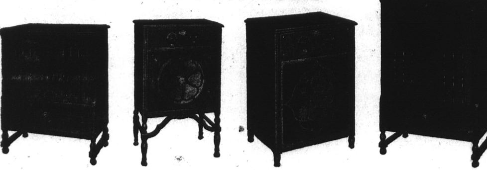
Just a few of the Many New Console Models