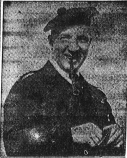
America wears a broad grin as Sir Harry Lauder, Scottish songster and comedian, arrives for a concert tour.