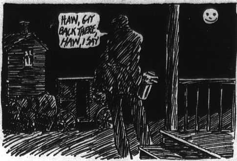
A NOCTURNAL NUISANCE